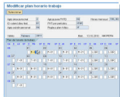
Plan horario de trabajo en SAP R3